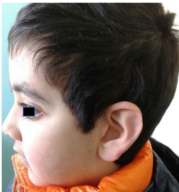
Figure 2 Typical facial features (profile shot).

megakariocytes, consistent with the diagnosis of ITP. Fluorescence in situ hybridization assay on bone marrow sample displayed no cytogenetic abnormalities in 7, 8, 21 chromosomes. To evaluate malformation framework, a high-throughput sequencing of KMT2D gene [23] was performed. The analysis showed a c.16384 G > C heterozygous sequence variation resulting in the change of aspartic acid with histidine and causing the D5462H mutation. During hospitalisation, the patient received a single intravenous immunoglobulin administration, at the dose of 0.8 g/Kg, achieving a partial response of platelet count ( 98000/\text{mm}^3 ). He was discharged with steroid home therapy (oral prednisone, 2 mg/Kg/day and progressive dose reduction in one month). During follow-up, he had a chronic and relapsing course of the autoimmune cytopenia, reason for which the study of lymphocyte apoptosis was carried out. Lymphocyte survival after Fas stimulation resulted normal and also the ratio of double negative (DN) [CD3+ TCR \alpha\beta + CD4-CD8-] T cells was within normal values (1%), thus ruling out an autoimmune lymphoproliferative syndrome (ALPS). Currently, three years after the first observation, the patient still has persistent leukopenia and relapsing episodes of thrombocytopenia, treated with recurrent courses of intravenous immunoglobulin and steroid.